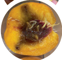
Apple and peach cut open showing rot, internal discoloration, and fruit fly maggot infestation